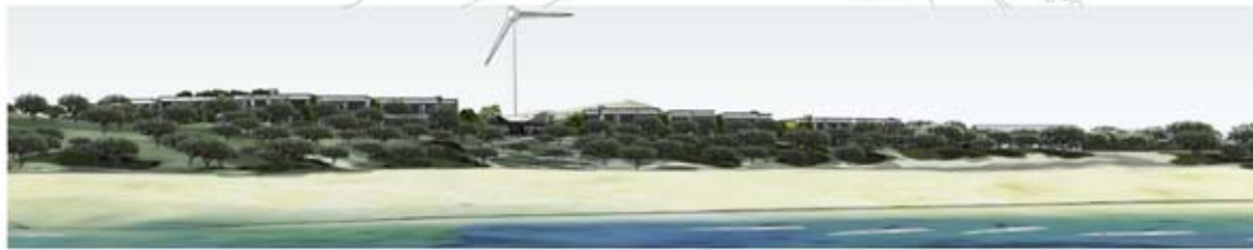
02 LONGREACH BAY VIEW VIEW