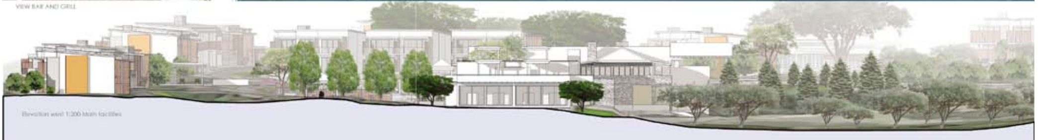
Elevation west 1,200 Main facilities