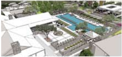
VIEW TO MAIN FACILITIES AND POOL