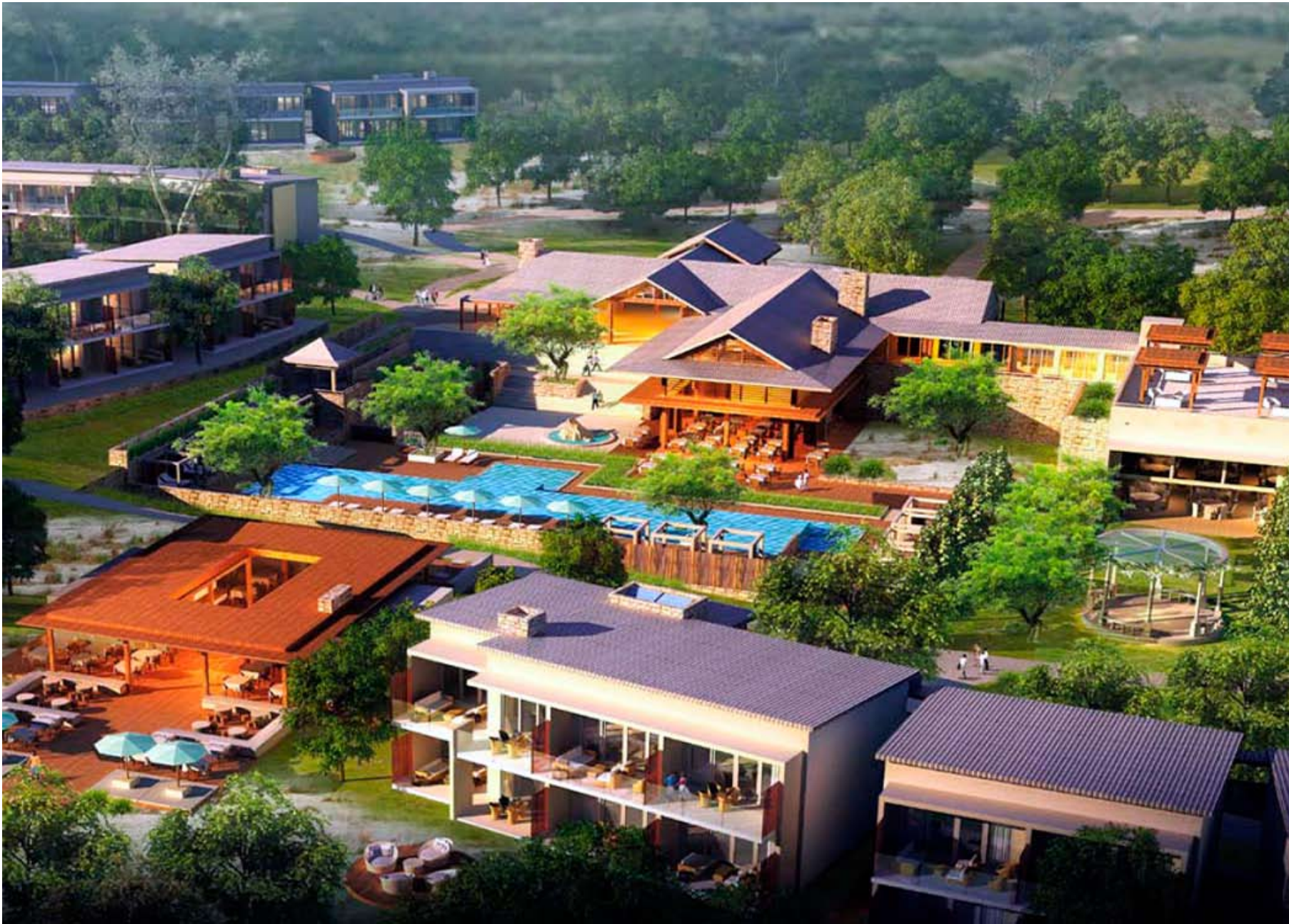
Image 8 - Artist Impression of Proposed Longreach Bay Hotel