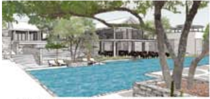
VIEW TO POOL AND SIGNATURE RESTAURANT