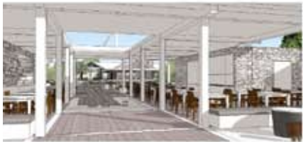
VIEW BAR AND GRILL