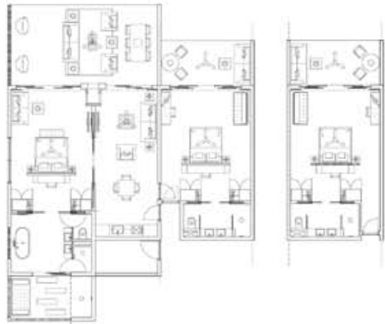
MASTER STUDIO (INTERCONNECTING) PLAN 1:200