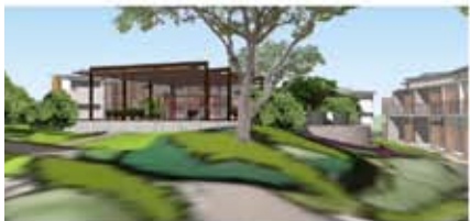
VIEW OF ADVENTURE PLAYGROUND