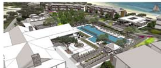
05 MAIN FACILITIES AND POOL VIEW