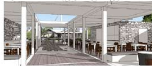
03 BAR & GRILL VIEW