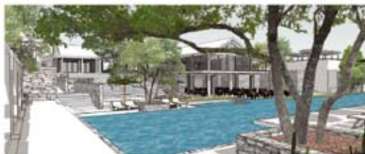
04 POOL AND SIGNATURE RESTAURANT VIEW