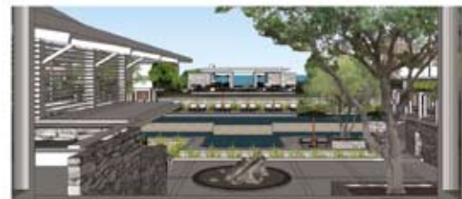
06 BAR AND GRILL VIEW