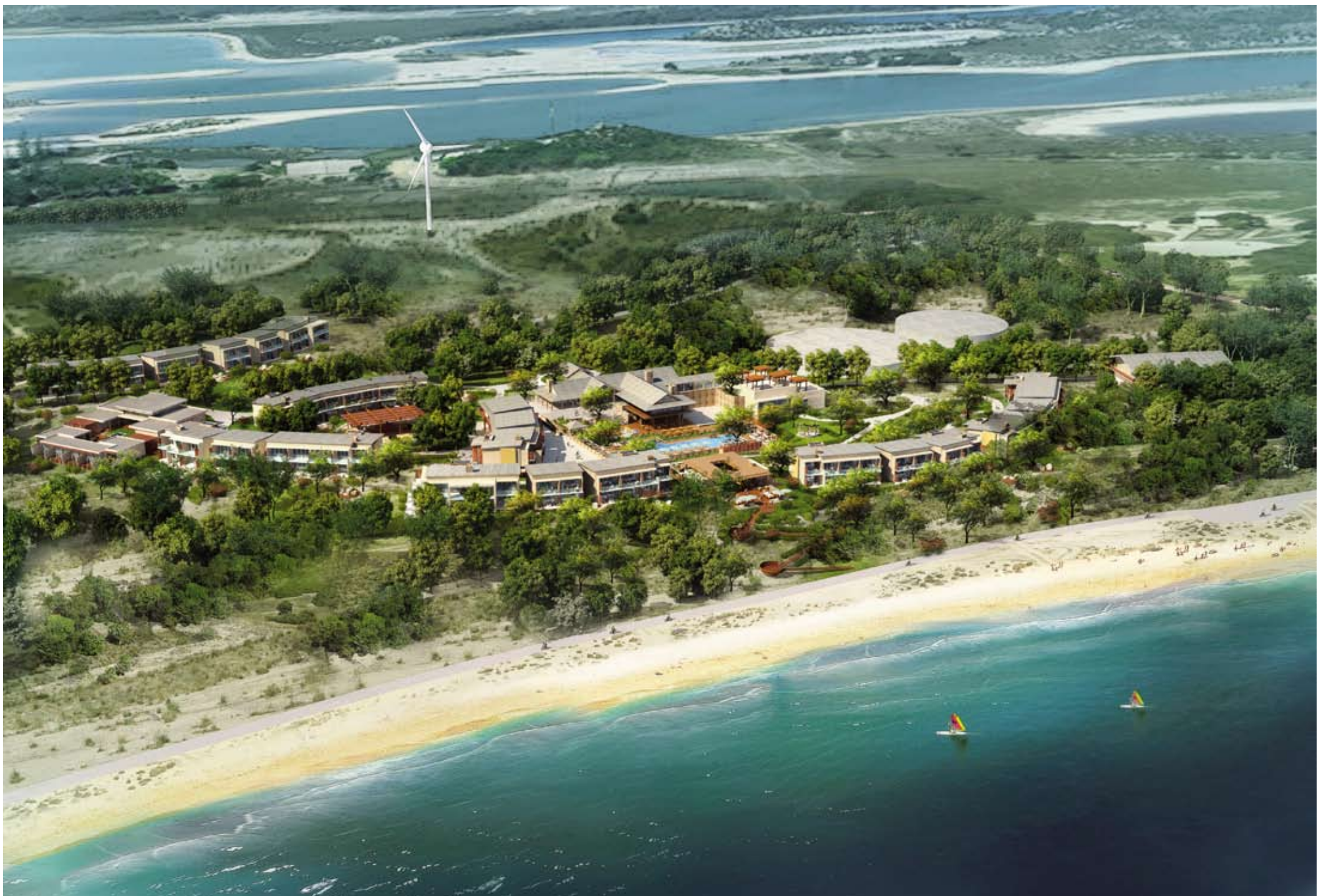
Image 1 - View of Proposed Longreach Bay Hotel